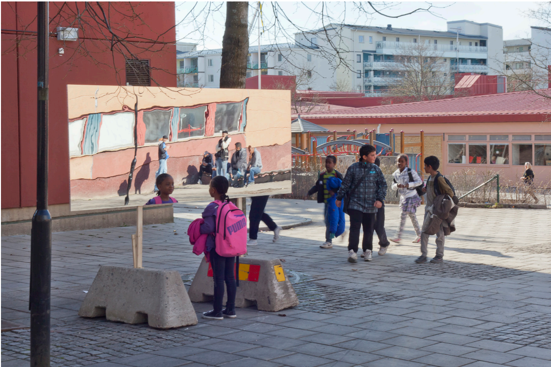
Fig. 1: Open Space by Anna Hasselberg (2012) is part of the art project in Husby.