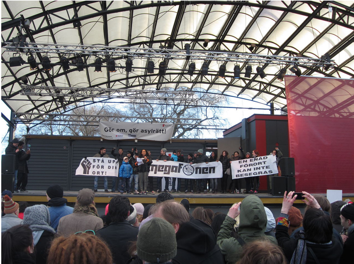
Fig. 2: Bana Bisrat from Megafonen at demonstration against Swedish migration policy in Stockholm 2013.